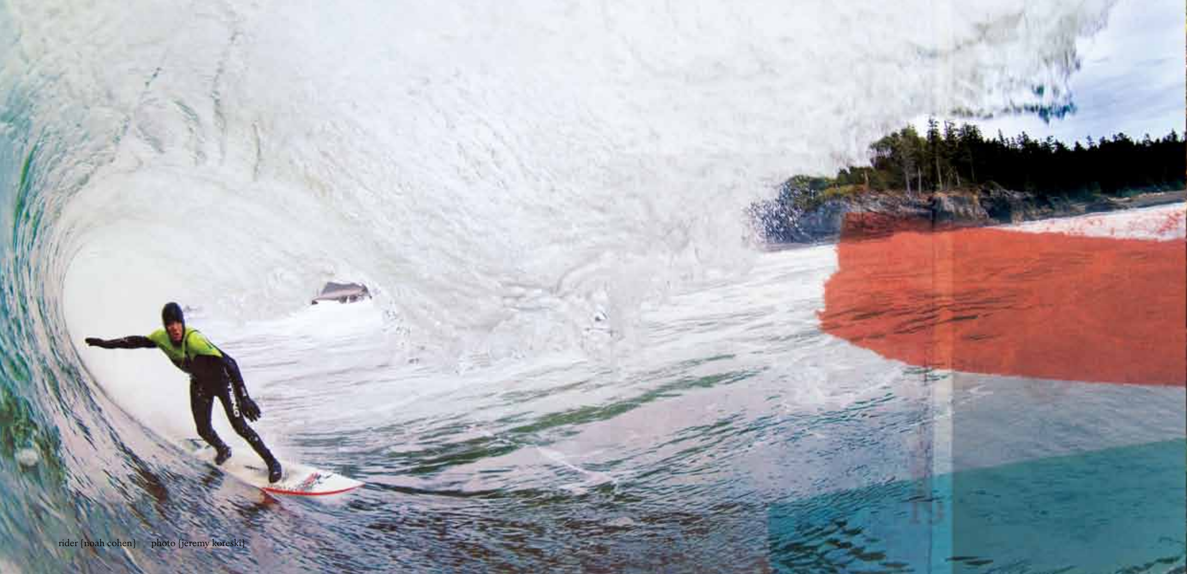
rider {noah cohen}